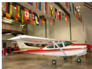
Cessna 185 inside the Moody hangar.