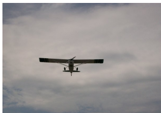
Plane taking off from Felt's Field.